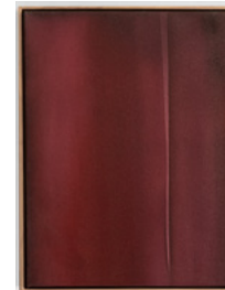
In Vino Veritas 24"h x 18"w acrylic & ink on raw canvas walnut frame $ 3,000

Where The Light Gets In A Subtle Rise & Gentle Fall