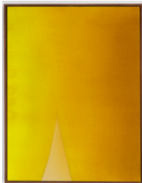
Where The Light Gets In 24"h x 18"w acrylic & ink on raw canvas walnut frame $ 3,000

The human eye never sees a flat chroma; it reads mixtures of wavelengths and interprets them in context. In Keren Toledano's veil paintings, the artist stages this phenomenon by layering acrylic stains on raw canvas. In a slow process of accumulation, new hues emerge from within the strata, as transparent films blend and bleed along edges. Colors shift in relation to their placement, and the act of seeing becomes a part of the painting.