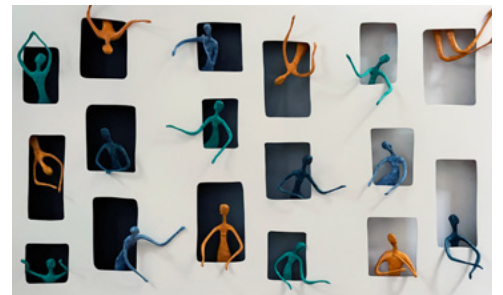
Neighborhood Tales I. 48" W x 30" H x 4" D $12,000